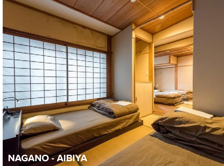
NAGANO - AIBIYA